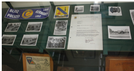
A sample display of some of the memorabilia contributed by members of the Regiment. Poster in the Museum.