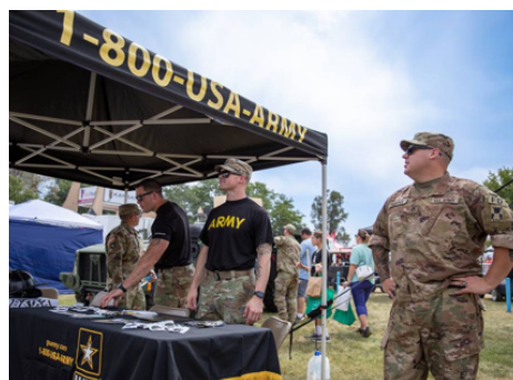
U.S. Army soldiers with the Wichita Recruiting Company hosted a recruitment booth at the Kansas State Fair in Hutchinson, Kansas on September 9, 2023.

The Army will transform how it attracts and recruits new soldiers, said its top leaders at a recent press conference. The moves come after the service failed to meet its recruiting targets for two consecutive fiscal years, causing its end strength to fall from an original level of 485,000 in late 2021 to around 452,000 active duty soldiers today--its smallest full-time force since 1940, the year before the U.S. entered World War II.