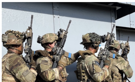
Ace Troop conducts urban reconnaissance live fire exercise.

Ace Troop focused on their urban reconnaissance progression going from team all the way to Troop echelon training.