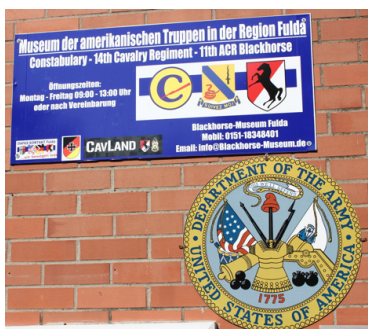
Welcome to the Museum of American Troops in the Fulda Region.