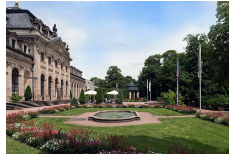
The face and gardens of Fulda's state-of-the-art Maritim Hotel, directly across from City palace and a short walk to old town city center.

Although arrangements are not completely finalized, we expect our Reunion hotel to be the Maritim Hotel in Fulda.