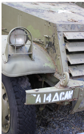
The museum salutes the Regiment from its post-WW II Constabulary days to its Armored Cavalry days throughout the Cold War.