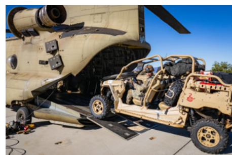
Deploying to PTA on the Big Island of Hawaii.

We then transitioned to supporting our 3IBCT teammates with their Joint Pacific Multinational Training Center (JPMRC) rotation. Ace provided OPFOR and O/C support for 3IBCT as they conducted their Brigade internal exercise. And the rest of the Squadron deployed to Pohakuloa Training Area (PTA) on the Big Island to provide OPFOR for 3IBCT as they air assaulted into PTA and attacked to seize key terrain.