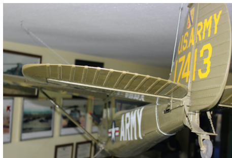
L-19 "Bird Dog" single engine recon plane.