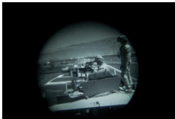
Diablo Troop conducting field feeding, delivering ammo, and nighttime logistics resupply.