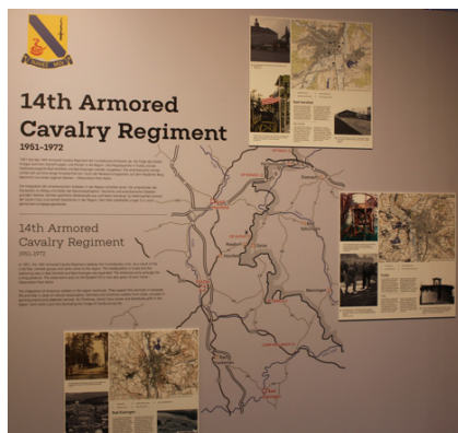
Another display in the museum.

We may or may not have more events this day in the Fulda area, or at least make