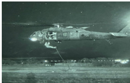
Ghost platoon conducts surf passage as part of its waterborne mobility training.

That consisted of recondo swimming, leaders attending the Marine Corps Coxswains course, individual boat launch site procedures, surf passage, and waterway navigation. These special mobility skills enable reconnaissance into the jungle terrain of the Indo-Pacific.