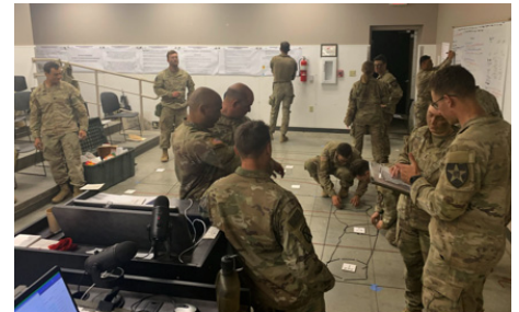
Troop Commanders, Platoon Leaders, and FIST teams from across the Squadron prepare to execute leader rehearsals in preparation for the Mortar Fire Support Integration Program.