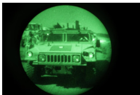
Bounty Troop conducts machine gun ranges to improve lethality in day and night.

mare,” conducted a full progression from individual to platoon Fast Rope Insertion/Extraction Systems (FRIES) and Special Patrol Insertion/Extraction System (SPIES) culminating with a nighttime full combat load FRIES insertion and SPIES extraction. The 2nd Platoon, “Ghost,” completed individual to platoon level waterborne insertion and extraction training.