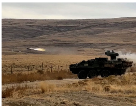
D TRP executes a TOW live fire as a part of its ATGM Gunnery.