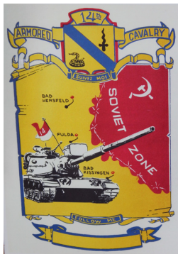
Poster in the Museum.