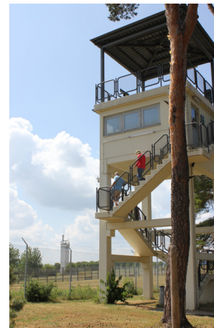
Observation Post (OP) Alpha as it is today, a far cry from the humble LP (Listening Post)/OP Alpha known to Scouts of the past.

After lunch in the kantine, we will cross into what was once "enemy territory" to visit a working German Army Kaserne at Bad Salzungen to view current military equipment and facilities and talk with soldiers of our very critical host-Nation partner. We will stop for a quick visit at the new building for the German American Museum in Tann before returning to the hotel. We will have a full-service Watering Hole that evening to keep the war stories and tall tales going into the evening.