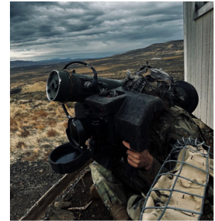
A Trooper from B TRP / 1-14 CAV demonstrates JAVELIN target acquisition as part of concurrent training during Yakima Training Center (YTC).